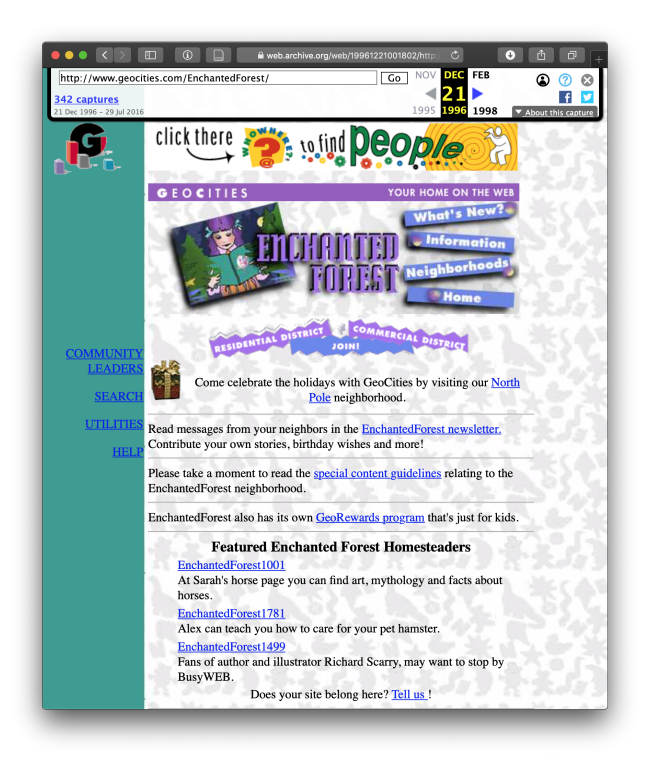
Figure 1: The GeoCities EnchantedForest neighborhood page, from the Internet Archive's Dec. 19, 1996 snapshot.

existence, GeoCities grew to encompass some seven million user accounts, spread over hundreds of millions of HTML pages [33]. It represents a substantial amount of information created by "ordinary users" during the pivotal early years of the web [34]. While early online content creators represented only a minority of the overall population, and are "disproportionately white, male, middle-class and college-educated" [19], so too are traditional archival holdings; these still represent voices that would be largely lost in non-digital memory systems. Today, the GeoCities web archive is available through the Internet Archive's Wayback Machine (see Figure 1), through raw crawls obtained by researcher agreements with the Internet Archive, and as a data dump from Archive Team (a group of "guerilla web archivists").<sup>1</sup>