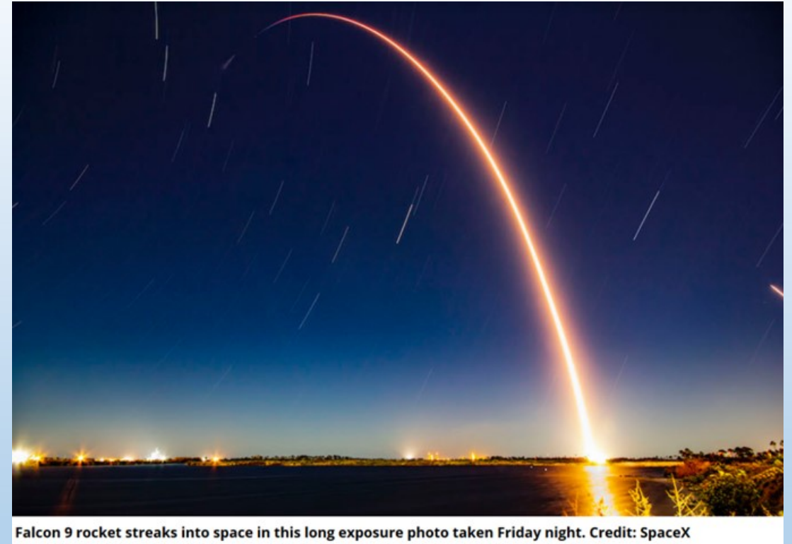
Falcon 9 rocket streaks into space in this long exposure photo taken Friday night.