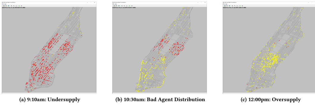
Figure 1: Several screenshots from the simulator (red dot: available resource, yellow dot: searching agent)