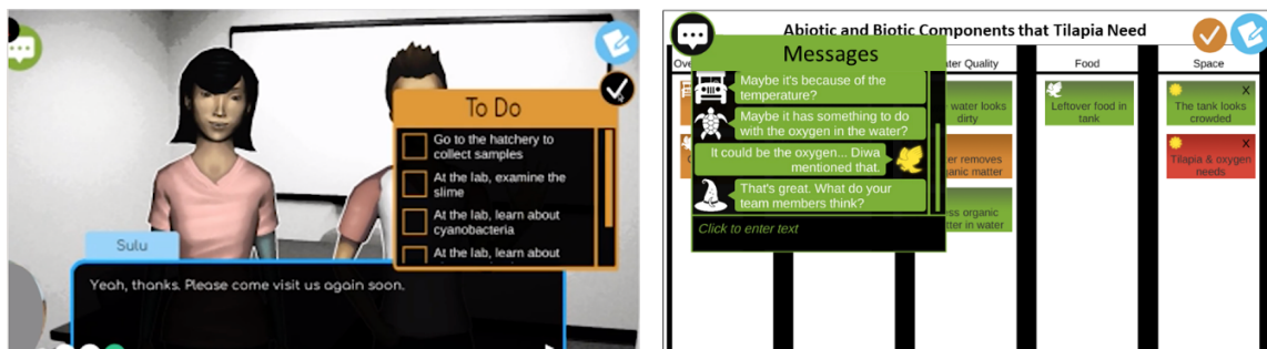
Figure 1. Screenshot of the collaborative game-based environment

To situate our design, we briefly provide an overview of the collaborative game-based environment that was designed based around PBL for middle school. As part of the PBL process, learners collaboratively engage in the process of scientific inquiry that emphasizes meaningful knowledge construction (Hmelo-Silver & Barrows, 2006). In our collaborative game-based PBL environment, students work in groups of four and solve an aquatic ecosystems problem that reflects grade six life science subject matter. Students engage in several phases of inquiry in the game, individual investigation where they collect data from the learning environment and collaborative brainstorming where students share notes and negotiate the relevance of the information to the overarching problem (See Figure 1). Students' interaction data as they engage with the learning environment are captured and can be surfaced to the teacher. This information is then available to the teacher in real-time or as reports at the end of the classroom session.