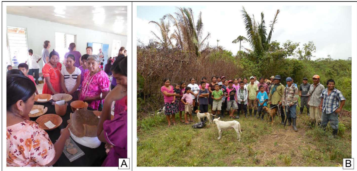
Figure 3. UAP engaged community-based archaeology and collaboration. (A) Santa Cruz woman looking at Ancient Maya pottery finds at Archaeology Day in 2014. (B) San Jose village members who toured the Ix Kuku'il Stela Plaza and visited excavations at Settlement Group 6 in 2015.

Santa Cruz) which they vest to a regularly elected board of UKAA executives, as a registered not-for-profit entity under the Companies Act of Belize. The UKAA was formally registered in 2007 and is responsible for overseeing and management and development on the lands of Uxbenká as community property in order to protect the cultural and natural heritage of the Maya people (per the UKAA Management Plan). From 2007-2015 the UKAA managed a rotational labor system to provide workers for the UAP survey and excavation fieldwork, and to assist with gathering data for a decade long climate monitoring project (Kennett et al. 2012; Ridley et al. 2015a, 2015b). The goal of this system was to distribute the resources brought into the community by researchers to members of each family in the village. Engagement of the UAP with the UKAA included Saturday classes for children to learn about local archaeology (Parks 2010) which evolved into environmental and archaeological lessons (Baines 2016), a summer Agro-Ecology program for youth (Cortez 2016), and the NSF funded TEACHA educational program (Baines and Zarger 2012). Additionally, for several years a local Archaeology Day was hosted by the UAP and