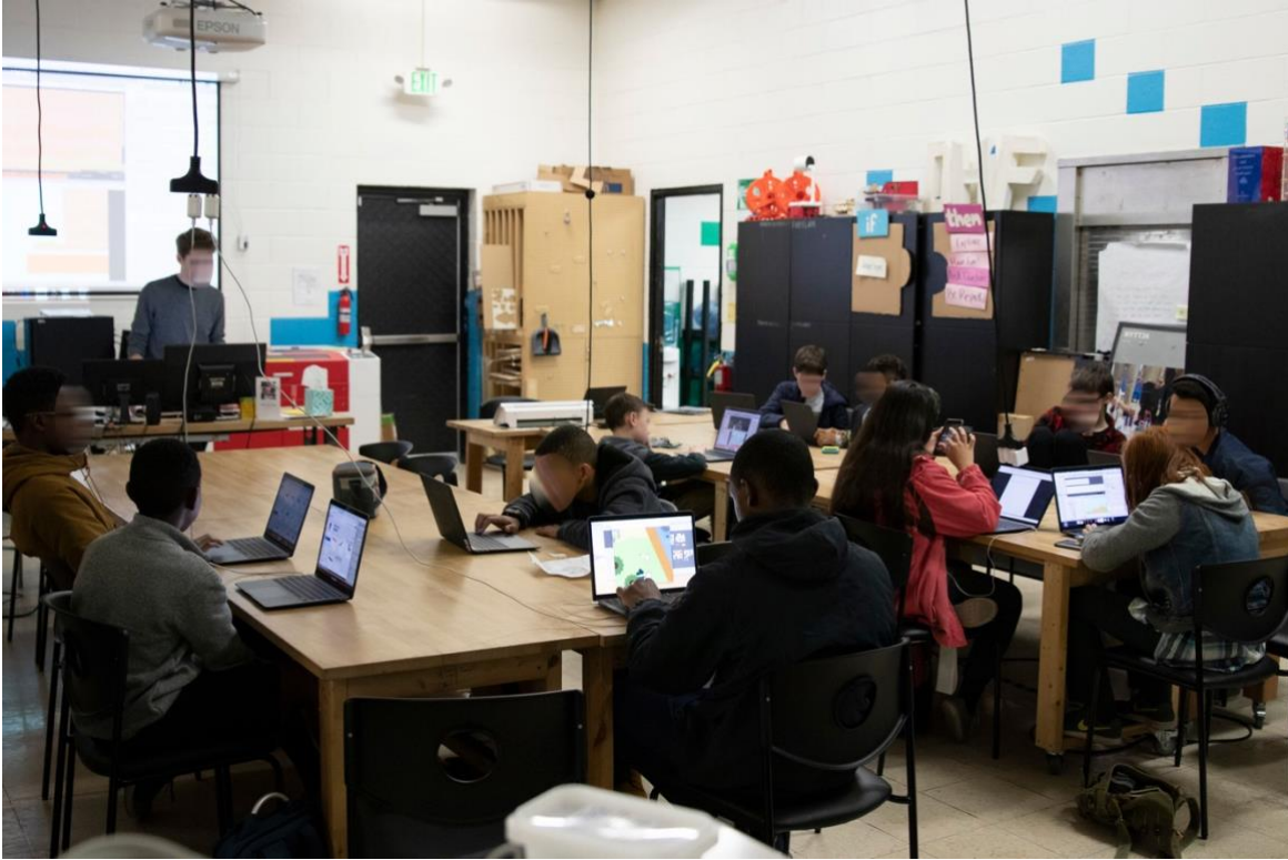
Figure 1: Typical setting for DHF’s courses: Classes take place in a large, open-plan space where youth work on self-directed projects and learn about design thinking, digital fabrication and computer science.

Key components of many DHF courses, including Maker Foundations, are digital fabrication, circuitry, coding and web development. The fabrication modules consist of 3D modeling and printing, as well as, laser cutting exercises and the use of a variety of materials including metal and wood. The fabricated objects are often combined with interactive electronic components, such as Makey Makey’s and Arduinos. A typical youth project might include the design and 3D printing of an interactive customized controller for a game developed by the youth on an entry-level coding platform, such as Scratch.