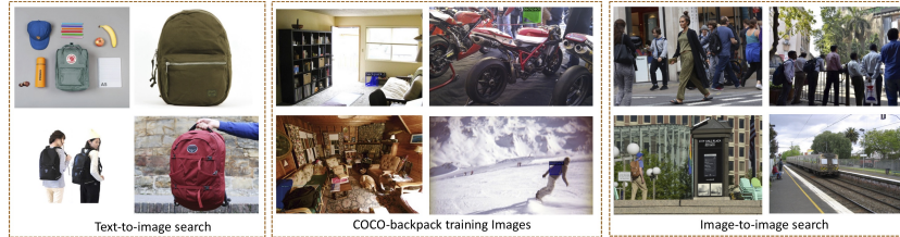
Fig. 7. Example Web images for augmenting COCO-backpack.

In addition to the overall comparison results in Table 2, we next ablate our approach and examine some key components. We also report the “upper-bound” results for augmenting COCO-backpack with Web-backpack by using the bounding box labels we collected for a subset of Web-backpack.