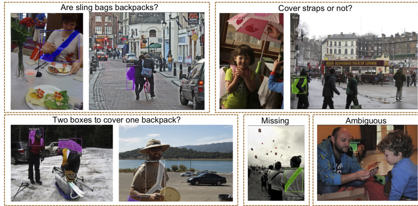
Fig. 3. Labeling errors in COCO-backpack. Two images in one group mean that they contain conflict annotations.

previous rater’s annotation. Please see the supplementary materials for more details of the annotation procedure, including a full annotation instruction we provided to the raters.