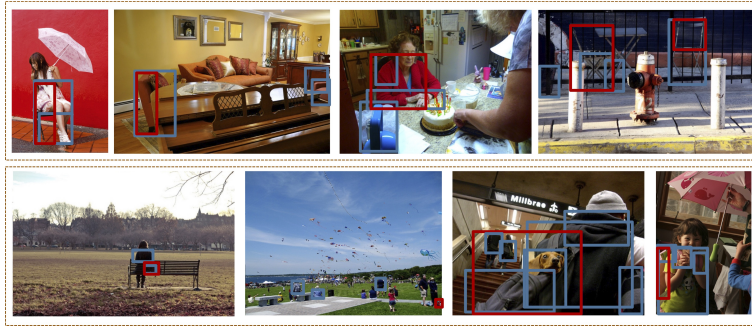
Fig. 1. Chairs (top) and backpacks (bottom) are difficult to detect in daily scenes. (Images and groundtruth boxes (red) are from COCO [34], and the blue boxes are predicted by the best detectors in our experiments.)

Grabner et al. [20] quantitatively evaluated the challenges of detecting functional objects like chairs. Another potential reason that contributes to the low performance in detecting backpacks and chairs is that they are too common to draw photographers’ attention. Consequently, they often sit out of the camera focus, appear small, and become occluded in context (cf. Figure 1).