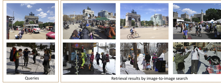
Fig. 2. Examples of the top three retrieved images from image-to-image search.