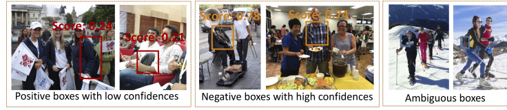
Fig. 6. The two panels on the left: Positive (negative) boxes chosen by the selective net yet with low (high) confidence scores predicted by the teacher detector. Rightmost: Ambiguous boxes according to the selective net.