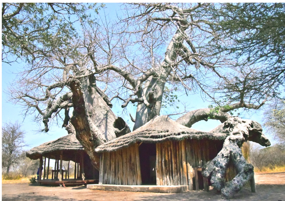
Figure 1. Makuri Lê boom with the auxiliary constructions of the hunting camp around its stems.

The Makuri Lê boom and its area. The big baobab is located in the Nyae Nyae Conservancy, established in 1998, around the Nyae Nyae Pans. The Conservancy covers the eastern part of the Tsumkwe district (Bushmanland), up to the border of Namibia with Botswana. The baobab is situated at 32 km ESE of Tsumkwe, 9 km SE from the Makuri village and 10 km SW from the Baraka village. Its GPS coordinates are 19°39.404' S, 020°47.143' E and the altitude is 1169 m. The mean annual rainfall in the area is 467 mm, while the mean annual temperature reaches 21.5 °C (Tsumkwe station). The investigated baobab is a „laying tree”, i.e., „Lê boom” in Afrikaans, such as the famous Dorslandboom, which can be found at 35 km NNE of Tsumkwe [13, 18]. We named it Makuri Lê boom.