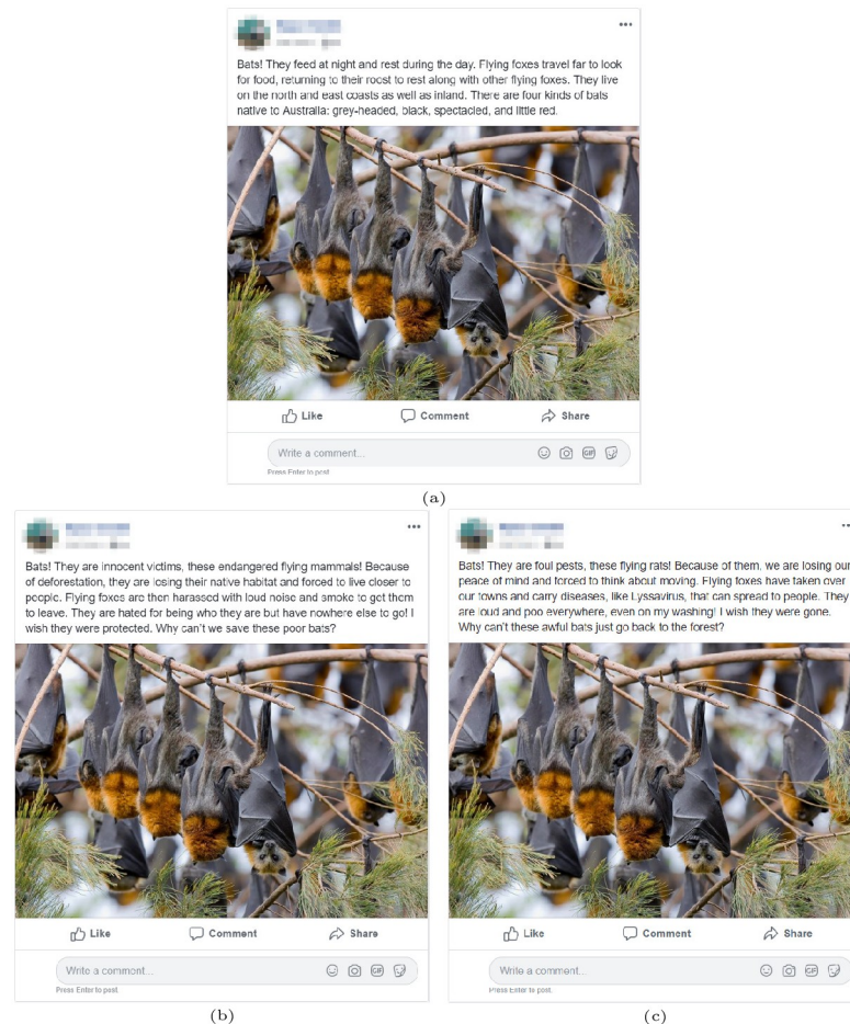
Fig 2. Depiction of non-narrative (a), victim narrative (b), and villain narrative (c) conditions, with image treatment. See S2 Fig for depictions of non-narrative, victim narrative, and villain narrative conditions without image treatment. Survey participants were randomly assigned only one of the six conditions.

https://doi.org/10.1371/journal.pone.0244440.g002