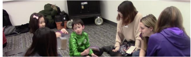
Figure 5. Children comparing bags of seeds (Session 3).

bag around and said, “ oh no! ” In this case, power over users occurs as the group made a decision that appeared to be not equal to a child user. Biya’s team expected children to be able to wait patiently (a perfectly reasonable request), but they did not recognize that by giving one child the bag with the more curious seeds, the session created a less than exciting experience for the other child holding a bag of seeds.