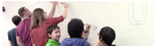
Figure 2. Children and students during snack time (Session 3).

Building rapport between designers and users [61] is a critical component of participatory design [19, 34, 37]. The Cooperative Inquiry [33] method, in particular, allocates the first 15 minutes of a design session for establishing rapport: an informal “snack time” for designers and users to eat and talk together and a “circle time” share, which serves both as a formal introduction and ice breaker. Despite this structure, we observed that a majority of HCI students did not focus on rapport building, especially in their first set of sessions. For example, during “snack time,” the HCI students self-segregated and communicated amongst themselves, rather than talking with the children (Figure 2). In “circle time,” some HCI students felt uncomfortable revealing information about themselves to the group, which was intended to strengthen connections. For example, Dale said, “ I didn’t like talking about my age because I’m 37. I’m there with 19-year-olds, but it was cool. Everyone talked about their age. ”