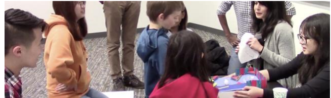
Figure 4. Children playing with pinball machine (Session 4).

disruptive to the designers’ plans, these children were providing valuable feedback (whether recognized or not). In Yue’s case, the child was absorbed by playing with their pinball prototype—demonstrating engagement and providing ample opportunity for observational analysis (Figure 4). Often, however, the HCI students were focused on how they personally believed children should interact based on their protocol.