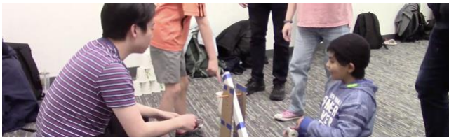
Figure 3. Children exploring uses of the trebuchet (Session 1).

When children started using prototypes, they often did so in unexpected ways. For example, children attempted to eat the chia seeds initially brought for an experiment (Session 3) and repeatedly threw large objects using an early-stage trebuchet prototype (Figure 3, co-design Session 1). HCI students had difficulty responding and adapting to this unexpected behavior, which sometimes led to frustration, demoralization, and a feeling of lack of control. Stephan, a member of the Trebuchet team, said: “As designers it really challenged our concept of affordances... they would make use of anything that they would see in the way they wanted to... they used the trebuchet to throw projectiles at the windmill... that was not what we were expecting.”