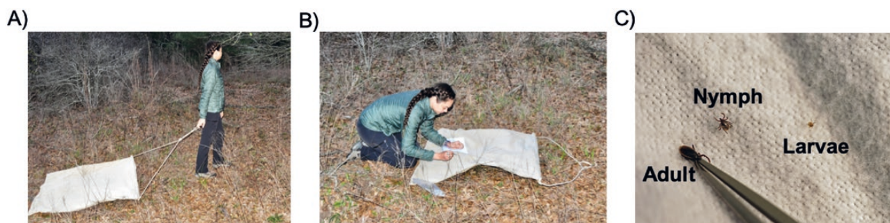
Fig. 1. Demonstration of tick dragging in the field. The series of panels show (A) walking to the pace of the ‘wedding march’ (approximately 50 m/min, a 30-min mile, or 1.8 miles/h) with the drag cloth trailing behind the collector, (B) pausing after 15 m to remove any collected ticks, and (C) a size comparison of Ixodes pacificus at each life stage to demonstrate the differences in size of the three tick life stages.