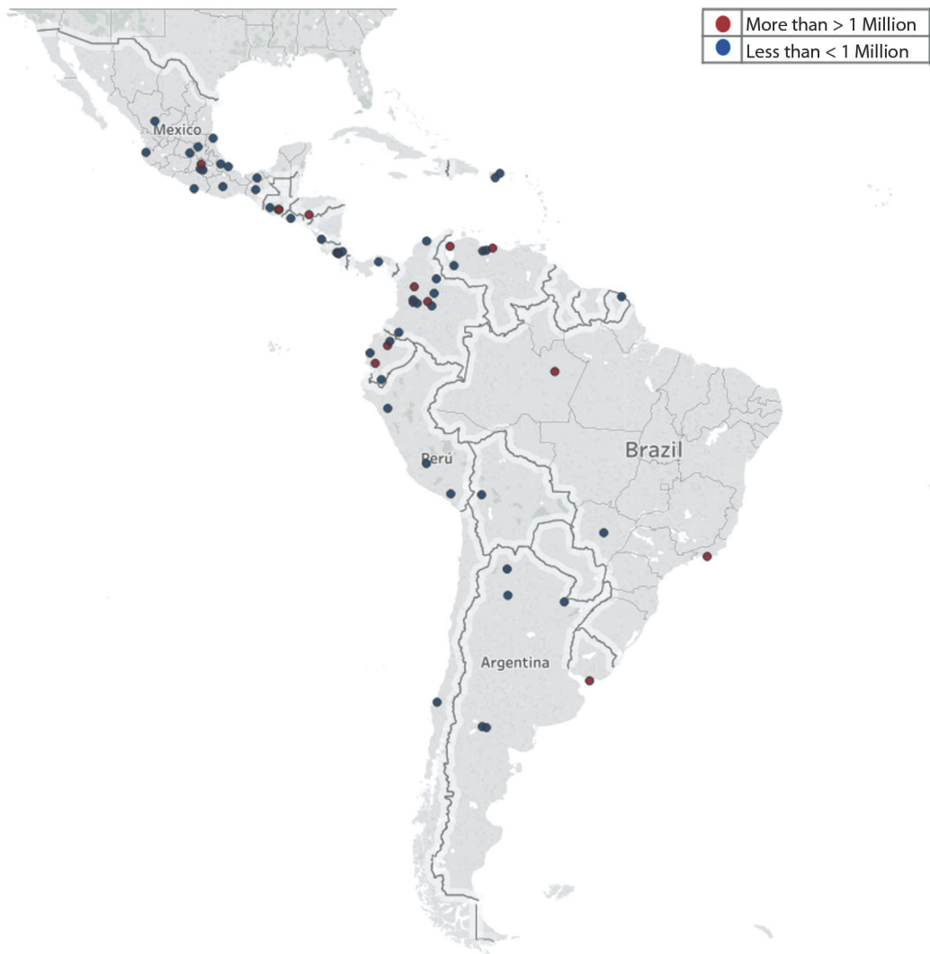
Fig. 1. Latin American cities (approximate location) included in our study, based on answers from survey participants. Support for research group EIS-UTP.