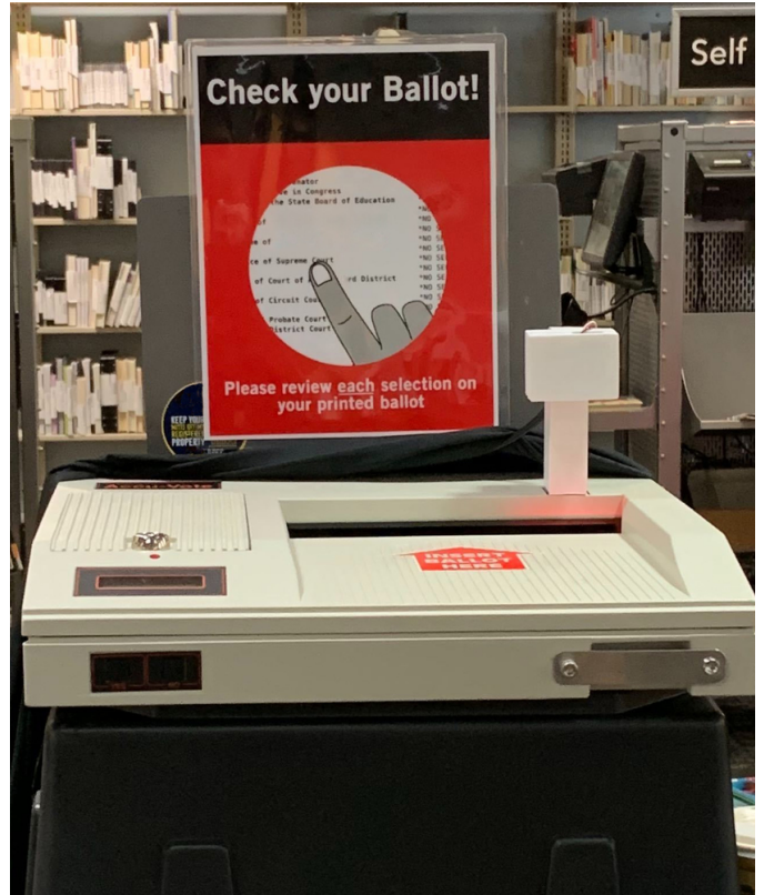
Fig. 3: Warning Signage . One of the interventions we tested was placing a sign above the scanner that instructed voters to verify their ballots. Signage was not an effective intervention.

E4: Signage A sign was placed above the scanner that instructed voters to check their printed ballots, as shown in