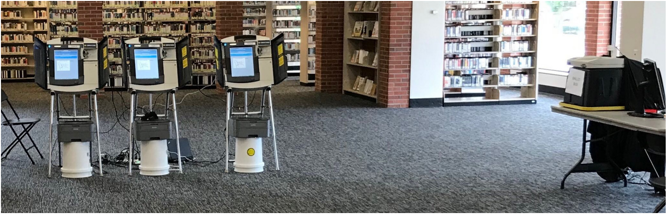
Fig. 1: Polling Place Setup . We established mock polling places at two public libraries in Ann Arbor, Michigan, with three BMDs (left) and an optical scanner and ballot box (right). Library visitors were invited to participate in a study about a new kind of election technology. The BMDs were DRE voting machines that we modified to function as malicious ballot marking devices.

on how to use the equipment, but they were not alerted that the study concerned security or that the BMDs might malfunction.