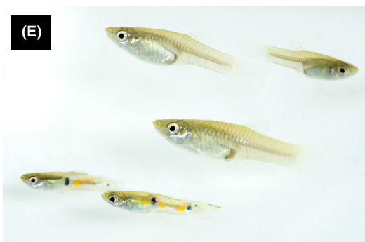
Photo 2. Portraits of each study species. (A) Polygonum viviparum. (B) Borderea chouardii. (C) Vulpicida pinastri. (D) Paramuricea clavata. (E) Poecilia reticulata.