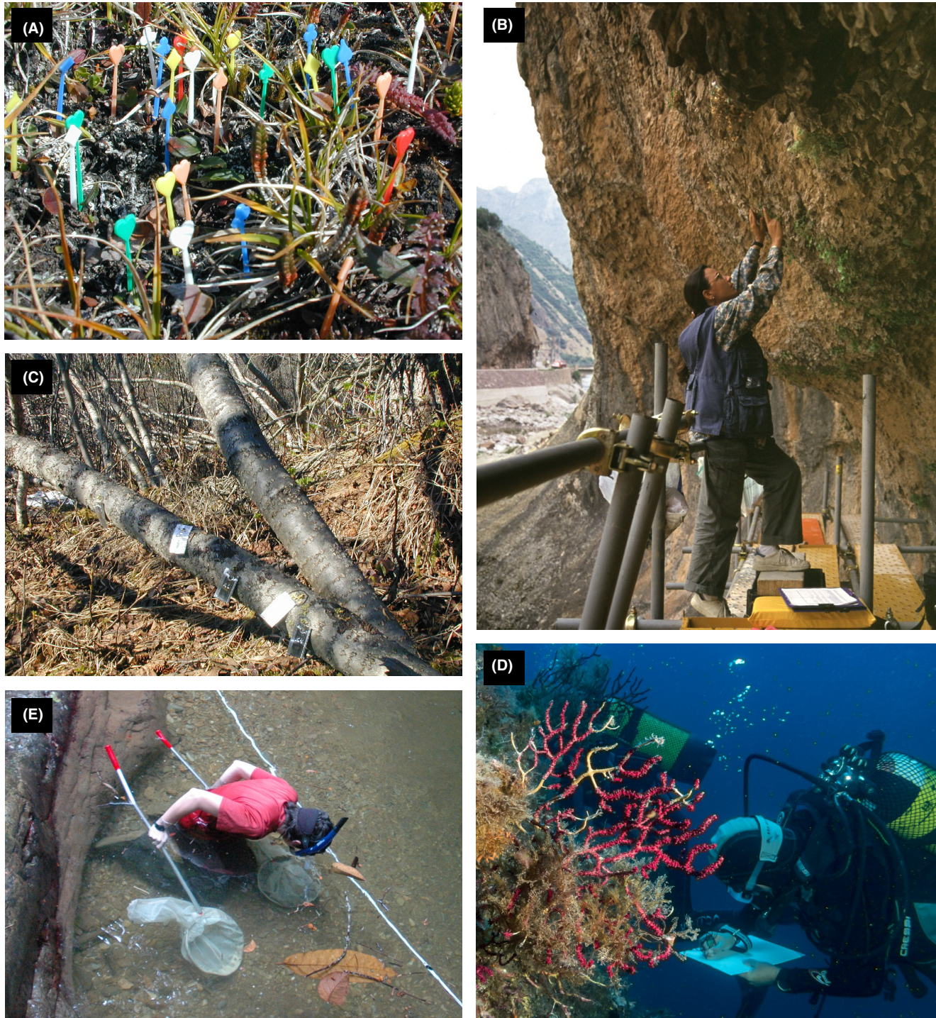
Photo 3. Examples of field methods used in each demographic study. (A) Individual Polygonum viviparum are marked using multi-colored party toothpicks. (B) Many Borderea chouardii exist on high cliffs and must be censused and measured using scaffolding and ladders. (C) Each Vulpicida pinastri thallus is marked with a tree tag stapled below it on an alder stem. (D) Paramuricea clavata colonies are relocated and measured by research divers who must be careful to not damage the colonies as they work. (E) Poecilia reticulata are relocated by intensive capture efforts in each stream section.