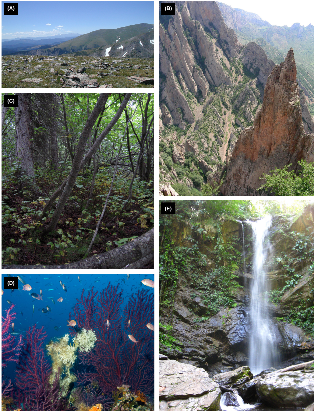
Photo I. Habitats of the focal species and populations used in this study. (A) Niwot Ridge, Colorado, United States, site of data collection for Polygonum viviparum, the alpine bistort. (B) Noguera Ribagorzana Valley, Spain, the study site and the only natural population of Borderea chouardii. (C) Boreal forest in the Wrangell Mountains of Alaska, United States, site of the Vulpicida pinastri study. (D) Montgrí, Illes Medes, and Baix Ter Marine Natural Park in the Spanish Mediterranean sea, one of three locations of our fieldwork on Paramuricea clavata, the Mediterranean red gorgonian. (E) The Marianne River, Trinidad, one of the sites for data collection on Poecilia reticulata, the guppy.