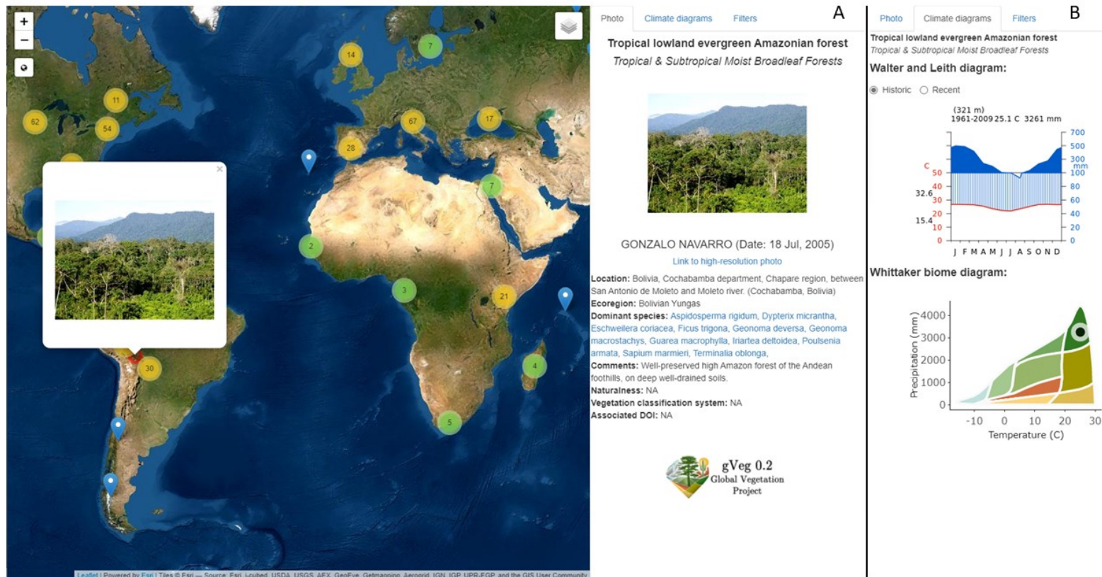
Figure 2. Screen shot of the online map application at http://gveg.wyobiodiversity.org illustrating a photo from a tropical lowland evergreen Amazonian forest in Bolivia within the pop up feature (on the left) and the photo metadata on right (A). Whereas (B) illustrates the historic and recent climate of the area in a Walter and Leith climate diagram and its location in a Whittaker biome diagram. Note that users can turn on additional global layers, including mean annual temperature and precipitation, elevation, aridity (MAP:PET ratio), biomes, and ecoregions. For clarity, we do not display the spatial filters tab here.