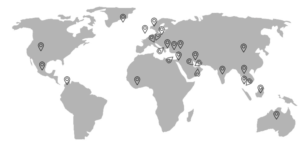
Fig. 1: Distribution of contact tracing apps in our study.

In total, we have built a dataset of 41 apps, including 26 Android apps from Google Play and 15 iOS apps from Apple App Store, as of June 15, 2020. Except one app (MyTrace) that exists only in Android, there are 25 apps available in both platforms. However, not all the 25 iOS apps could be downloaded because some of them ( e.g. , Stopp Corona) have restricted the location for downloading and we were not able to obtain them from our location. Additionally, for the iOS apps, we had to use a jail-broken iPhone to download them and extract the app code from the device. Next, we introduce these 41 apps in the following dimensions: