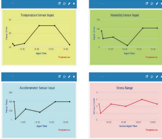
(b) CE Cloud Server Connectivity.