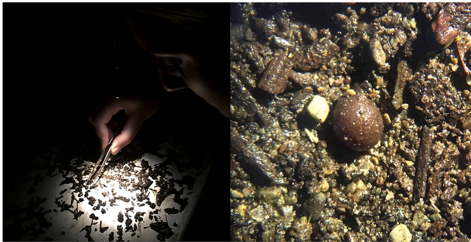
Fig. 3. Investigator sorting sifted material for pheretimoid cocoons (left) and single cocoon of Metaphire hilgendorphi under 10X magnification (right).

When hand sorting, it is essential to examine both leaf litter and the underlying mineral soil. This is especially important for juvenile earthworms and when litter is moist. We recommend the use of hand sorting for pheretimoids when possible.