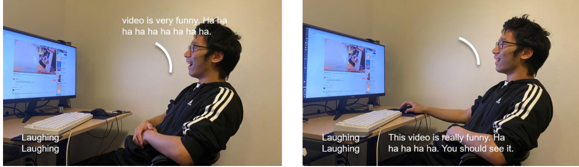
Figure 3: Speech-transcription can either be (A) placed on top of the speakers in the 3D space ( windows view ) or (B) move with the user's head ( subtitles view ).

For both views, the text scrolls up and disappears as the new transcription is appended. Users can also customize the transcribed text's font size (default: 0.75^\circ angular), the number of lines (default: 2), the width of each line (default: 60 characters), and the distance of captions from the eye (2m, 4m, 8m, or the default: projected onto background surfaces (e.g., walls) [14]). To stabilize jitter, the text block stays at the same location and smoothly drifts along when the user's head moves by at least 25^\circ .