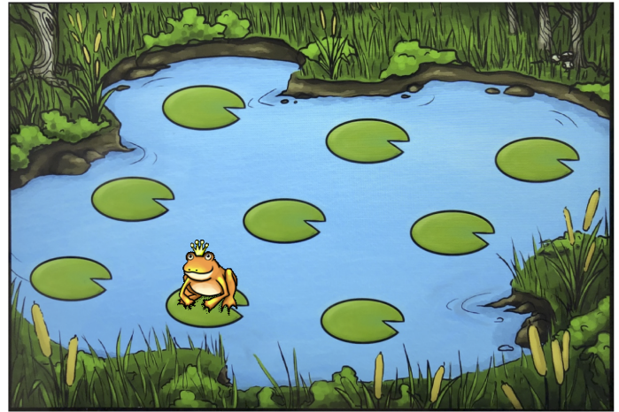
Figure 1 Still image from adapted Corsi-Block task

ranged from two to seven, with two trials at each span level (i.e., two trials of two, two trials of three). The first two trials were practice trials with a string of two color words (e.g. green, blue) with feedback. The experimenter ended the task if the participant incorrectly answered both trials of a particular span. The dependent measure was the highest span that they were able to recall correctly.