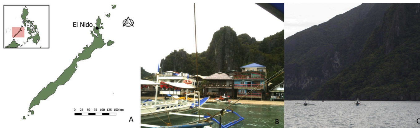
Fig. 1. Panel A: El Nido is located on the northern tip of the island of Palawan in the western Philippines. Panel B: The tourist waterfront with hotels and restaurants. Panel C: Small-scale fishers fishing the nearshore waters.