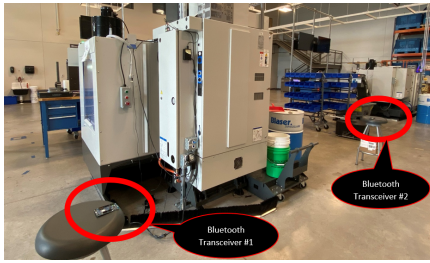
Figure 1: Picture showing our deployment at the Indiana Manufacturing Institute

will customize the transceiver with memory that will keep track of the time when a user had last interacted with the surface. If a different user comes close to the surface and wishes to touch it, then a proactive alarm will be presented. While there has been significant technology development around the world on the broad topic of contact tracing, most of this is commercial, closed-source, expensive, and not customizable to our university environment. For example, in a privacy-preserving mode for inter-user proximity tracing, we may not want the data to leave the user's device. On the other hand, for laboratory asset surface monitoring, we may want to create a central database at the department so as to take mitigation actions, like determining the schedule for cleaning. Our proposed solution approach is customizable in both these and several other dimensions, including the intrusiveness of the alert (such as blinking LED or low or loud buzz).