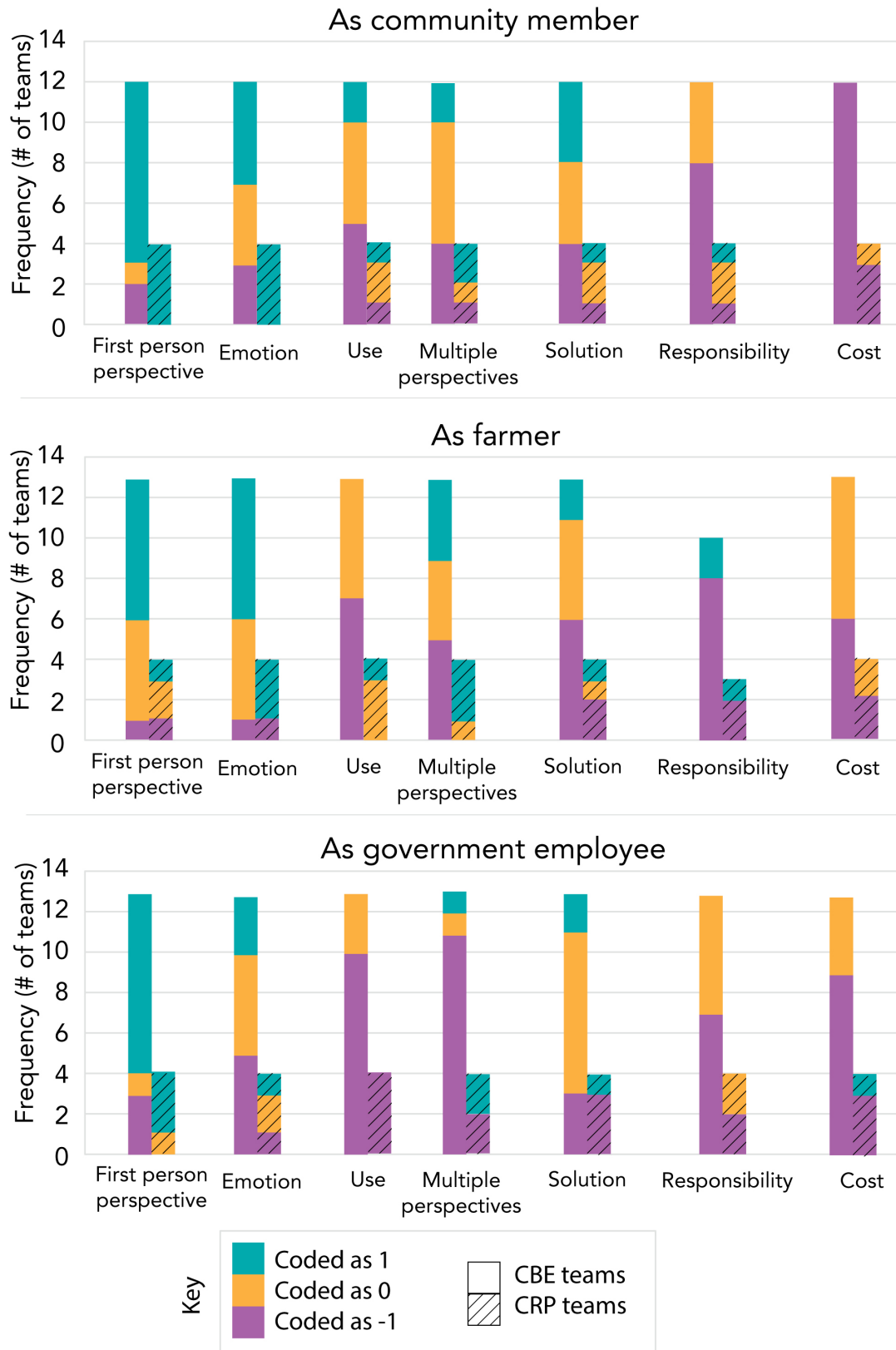
Figure 1. Frequencies of codes by role (community member, farmer, government employee). Because the group sizes are so different, we avoid using percentages, which could be misleading.