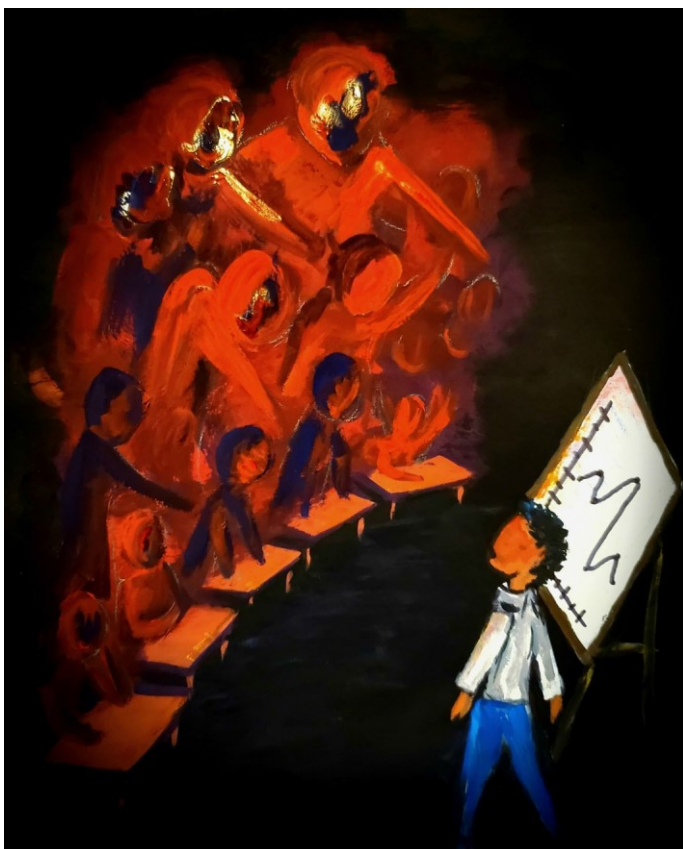
FIG. 1. Image by Shannon E. Cramer.

subjective material in a low stakes setting. For example, lab members could discuss their peers' haiku, clay sculpture, or line drawing to improve the delivery and intent of their commentary. By working with unfamiliar materials and subjects, we challenge students to face their fear of failure, judgment, and imperfection and instead focus on refining their work. Practicing criticism in this manner allows students to develop the skill of critique in parallel with their other scientific skills, such as data collection or statistical analyses. As students' progress through their training, they should deliver critique on scientific products in person and in writing. They should also experience incorporating edits into their work and re-presenting it to peers. As critique and review are essential components of our field, mentors and educators should focus on critique throughout the science education process, improving the educational experience and our professional science practice.