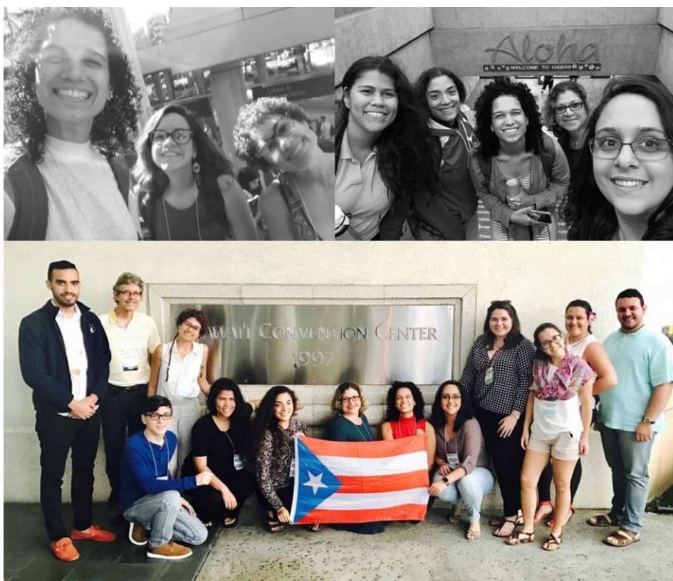
FIG. 2. My Puerto Rican mentee fellows from the ASLOMP 2017 program.

capable of redefining better my life-professional goals; as an example, I started my Master's degree in Fall 2017. In fact, my capabilities are still growing due to the initial opportunity, so let's say before, during, and