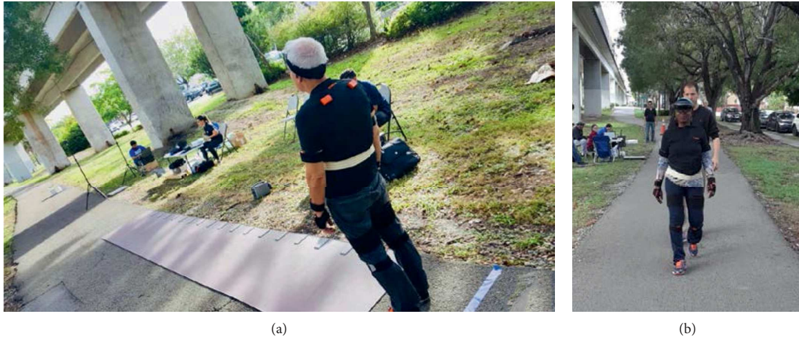
FIGURE 1: Participant at the beginning of the mat before initiating a walking trial (a) and a participant finishing the walk after crossing the mat (b).