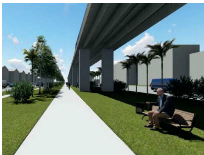
FIGURE 3: Fully immersive virtual reality environment used for balance testing.

AR and no glasses/goggles. The computer scientists who are part of the team and co-authors designed, produced, and coded the AR and VR environments.