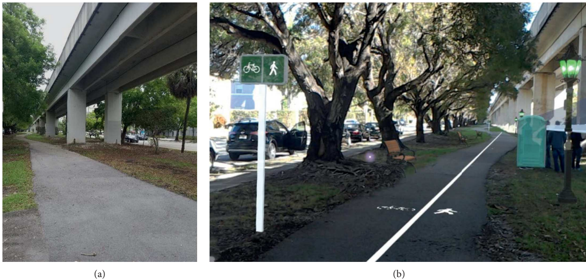
FIGURE 2: Environment not including (a) and including (b) the augmented reality displays of (from right to left) a transparent wall, light fixtures, bathroom, lane separations for bikes and pedestrians, benches, and signage.