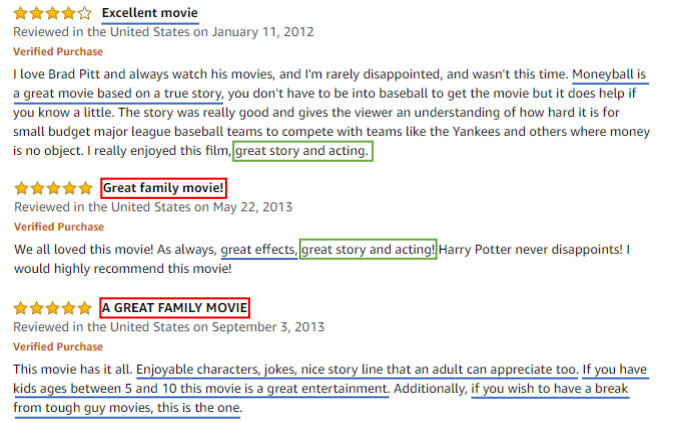
Figure 2: Three user reviews for different movies from Amazon (Movies & TV category). Sentences of explanation purposes are highlighted in colors. Co-occurring explanations across different reviews are highlighted in rectangles.

Then, a follow-up problem is how to detect the nearly identical sentences across the reviews in a dataset. Data clustering is infeasible to this case, because its number of centroids is pre-defined and fixed. Computing the similarity between any two sentences in a dataset is practical but less efficient, since it has a quadratic time complexity. To make this process more efficient, we develop a method that can categorize sentences into different groups, based on Locality Sensitive Hashing (LSH) [14] which is devised for near-duplicates detection. Furthermore, because some sentences are less suitable for explanation purpose (see the first review’s first sentence in Fig. 2), we only keep those sentences that contain both noun(s) and adjective(s), but not personal pronouns, e.g., “ I ”. In this way, we can obtain high-quality explanations that talk about item features with certain opinions but do not go through personal experiences. After the whole process, the explanation sentences remain personalized, since they resemble the case of traditional recommendation, where users of similar preferences write nearly identical review sentences, while similar items can be explained by the same explanations (see sentences in rectangles in Fig. 2).