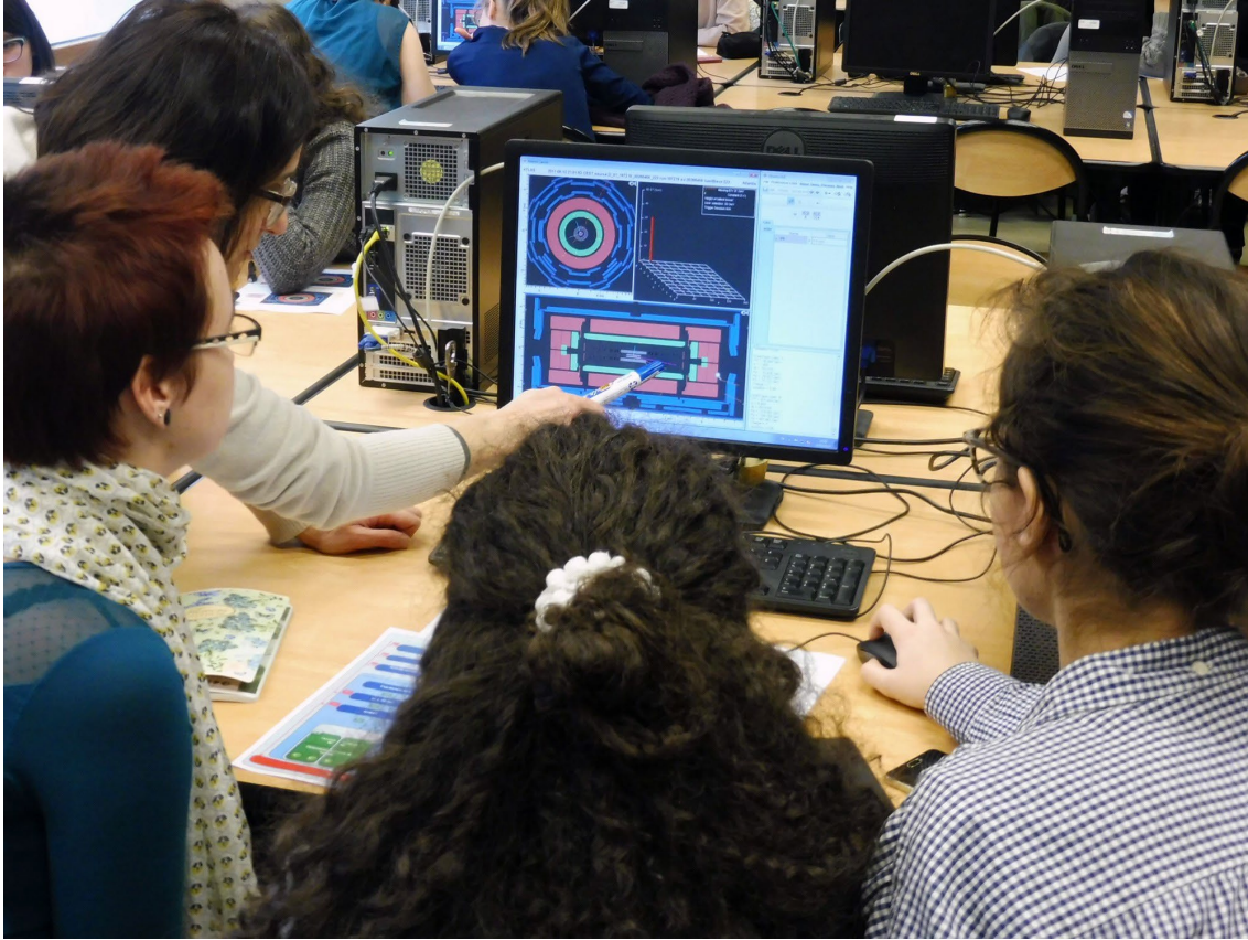
Figure 2. Students learn from a role model in a masterclass for International Day of Women and Girls in Science..