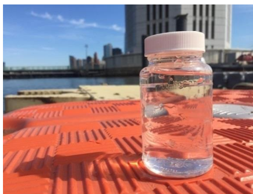
Figure 3. Water Sample from the mouth of the East River (6-26-20)