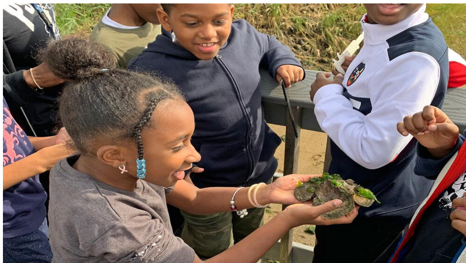
Figure 2. Oyster Research and Restoration in Canarsie, Brooklyn (2019)