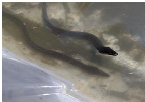
Figure 4. American Eels in the Gowanus Canal (8-7-20)