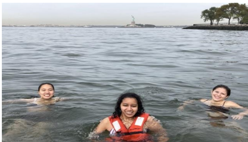
Figure 5. Citizen scientists in the waters of New York Harbor