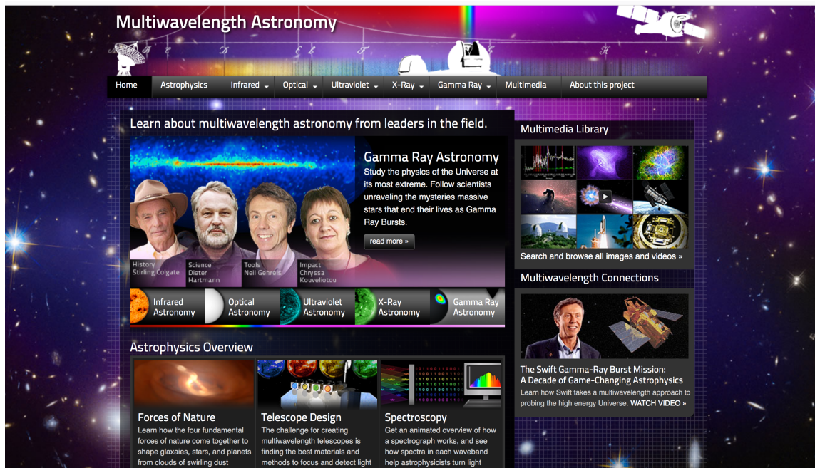
Figure 2: The home page of the multiwavelength astronomy website.

be improved. The students also carried out research under their teachers and our supervision, and presented their projects at the end.