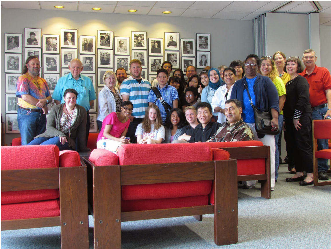
Figure 3: A picture (taken by me) showing the group at the NASA summer program of July 2013. This image shows all organizers, the CPS teachers, students, and the course evaluators. That's me in the front in the brown shirt. I literally had to jump over the couch after setting the 10-second delay timer to take the photograph (but this ensured that everyone is smiling :))

Students met and interacted with some of the experts responsible for the lessons. According to their blogs, they really enjoyed this aspect, since they got to interact with leaders in the field and personally ask them questions. The lessons themselves need to be at an appropriate level. The students would comment on the day's lessons in their blogs, so if something was not up to standard, it was quickly brought to our attention. We suggest that writing of daily blog posts should be encouraged, and an appropriate blogging medium set up.