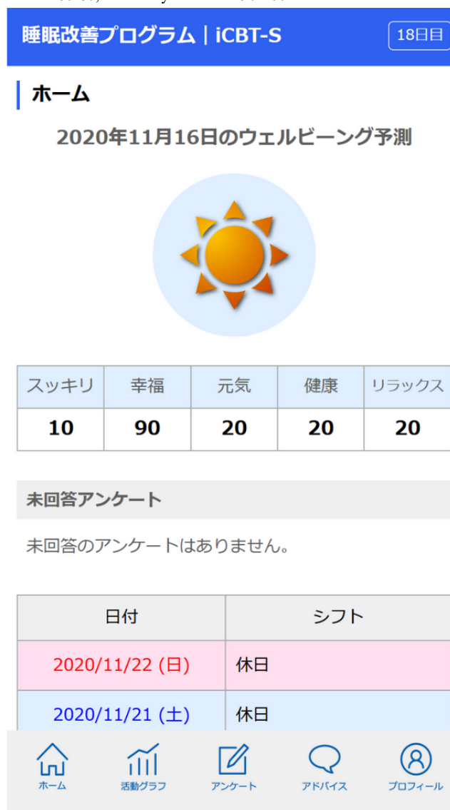
Figure 2. Well-being prediction is displayed in numbers (rounded to the nearest 10) and as a visual icon that resembles a weather forecast: cloudy for scores 0-50, cloudy and partly sunny for scores 60-80, and sunny for scores 90-100.

The app has a total of five tabs: “dashboard,” “activity/sleep chart,” “surveys,” “advice,” and “user profile.” On the “activity/sleep chart” tab, participants will see at a glance how much activity and sleep they have had in 24 hours for the past 7 days. These data are retrieved every hour from the Fitbit server