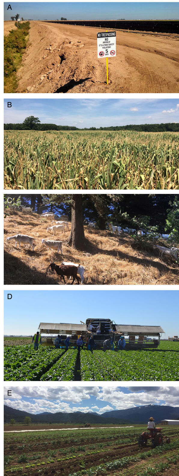
FIGURE 2 | Five cases of challenges in which farming systems must adapt to the triple threat: (A) Pathogens: A no-trespassing sign at the edge of a lettuce field in California, warning, “No animals! It’s a food safety violation!”

We do not expect most readers to read every case. Rather, we present a diverse palette of cases as self-contained applications of the framework from which