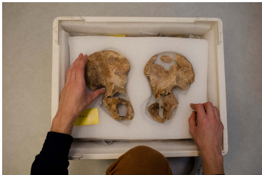
FIGURE 4. Storage of conserved skeletal elements using ethafoam sheets.

information. Photographic documentation of all conservation stages is crucial, especially in handling such a large assemblage (see also Zejdlik 2014). As mentioned previously, we photograph each crate or item when it arrives at the laboratory, including the state of original container, the label, and the contents. As standard practice, we also photograph each skeleton or skeletal element before, during, and after conservation. When photographing loose teeth or fragmented bones, we have found placing them in trays filled with black sand particularly useful. We propose organizing photographic archives in the following categories: a) excavation, b) before conservation, c) during conservation, d) after conservation, e) data collection, and f) publication.