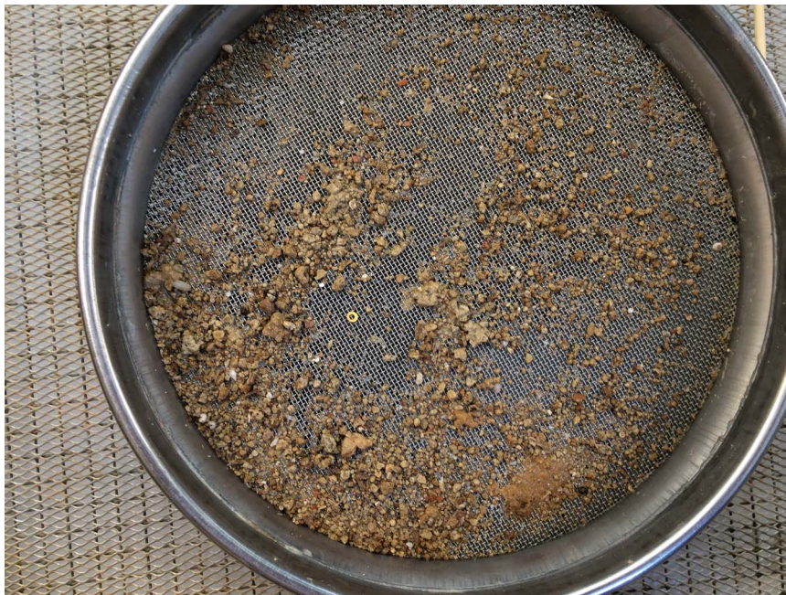
FIGURE 2. Golden bead of about 4 mm diameter recovered in the laboratory during the wet screening of soil masses from an otherwise poorly preserved jar burial of an infant.