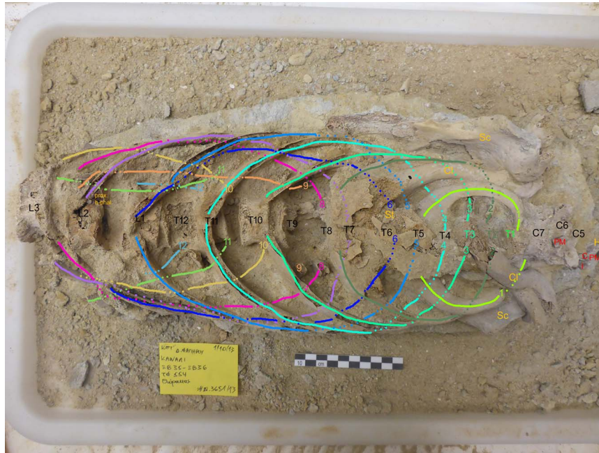
FIGURE 1. Example of a thorax, removed from the field in a block, during microexcavation and conservation in the laboratory (courtesy of Lukas Waltenberger).

temporarily and never left on the bones for more than a couple of days (Wills et al. 2014). In very fragile bone, we use Japanese tissue applied with Paraloid as an extra support. We avoid the use of filling materials, as the Phaleron remains are not intended for display.