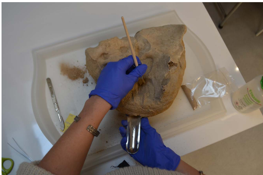
FIGURE 3. Removal of a dry soil sample from the pelvic area before conservation treatment at the laboratory.

The same sampling protocol can be used for commingled assemblages.