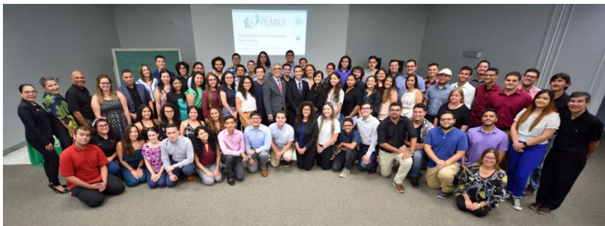
Figure 4: First cohort of PEARLS scholarship recipients and the faculty team involved.