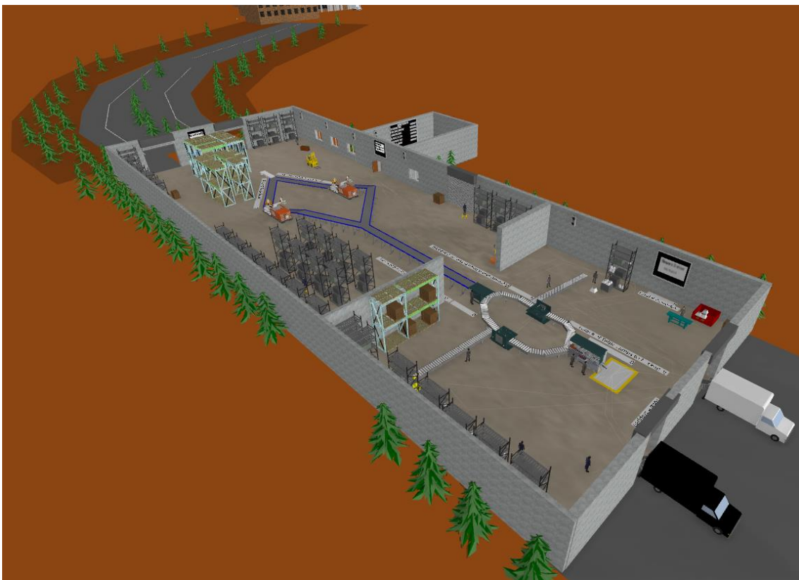
Figure 1. Snapshot of the 3D simulation model

The simulation model can be run on a regular computer where students can navigate through the model, collect data such as the table lamps demand, processing times, and percentage of defective table lamps, observe the animation and the system performance measures, and make changes to some of the system's parameters such as the capacity of the resources and inventory policy. In addition, the model can be run on an Oculus Quest or Rift S virtual reality (VR) headsets but that will require a VR-ready computer. To run the model on an Oculus Quest, the headset should be tethered to the VR-ready computer via a USB cable.