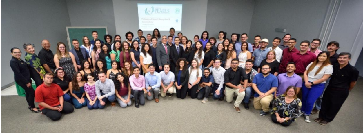
Figure 4: First cohort of PEARLS scholarship recipients and the faculty team involved.