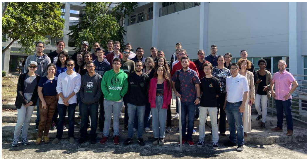
Figure 5: First cohort of RISE-UP students and the faculty team involved.