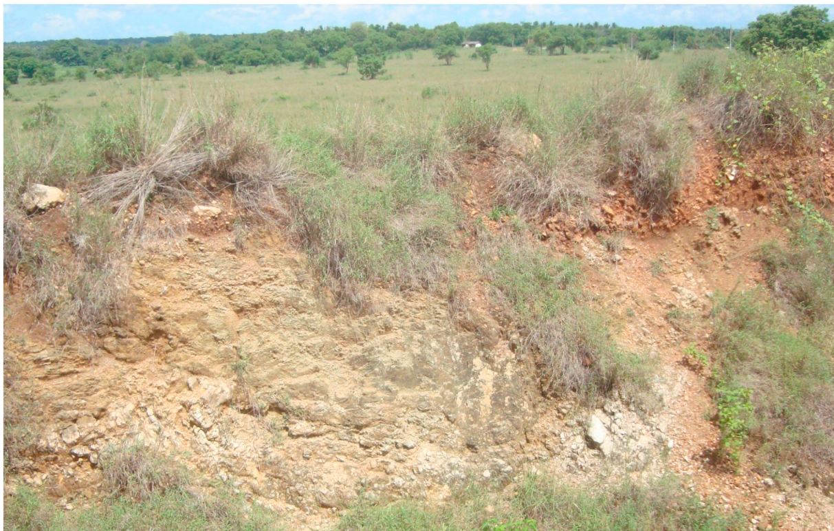
Fig. 1. An ultramafic environment at Indikolapelessa, Sri Lanka.

Ultramafic outcrops occur in highly populated areas. For instance, a wide distribution of ultramafics has been identified in populous areas within the Circum-Pacific margin and the Mediterranean (Oze et al., 2004b). An ultramafic body in Shih-Tao Mountain in the coastal range of eastern Taiwan, which is 2 km away from Taitung city, contains peridotite, pyroxenites, and serpentinite (Cheng et al., 2011). The ultramafic soil in the Eastern part of the Rudnik Mountain, near Salasi Village, Serbia, is extensively used for crop cultivation (Antić-