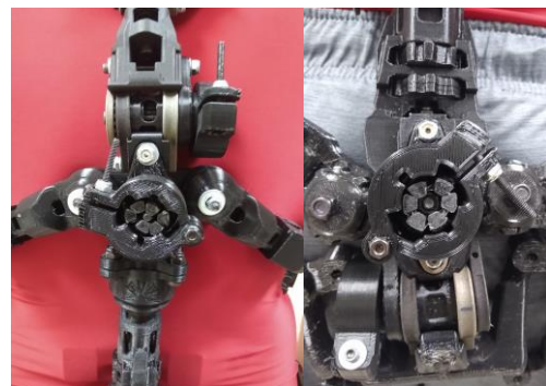
Figure 2. Close-ups of the couplings at different spinal column levels.