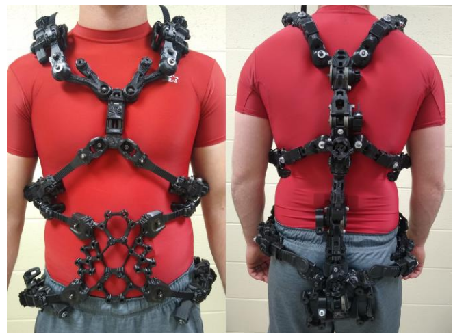
Figure 1. The trunk exoskeleton worn by a person, front and back.

Possible exoskeleton configurations: In each session, the participant wore the trunk exoskeleton in six configurations corresponding to all possible combinations of two compression settings (both thoracic and abdominal compression high vs. both thoracic and abdominal compression low) and three stiffness settings (all four couplings stiff, lower two couplings stiff, all four couplings not stiff). Both high and low compression were set differently for each participant based entirely on that participant’s subjective perception: high compression was the tightest elastic strap setting that was still considered comfortable by the participant while low compression was the loosest setting that was still perceived as pressure by the participant. Stiffness was varied between “stiff” and “not stiff” by engaging or disengaging the volute springs. Furthermore, there was also a “no exoskeleton” condition in both sessions.