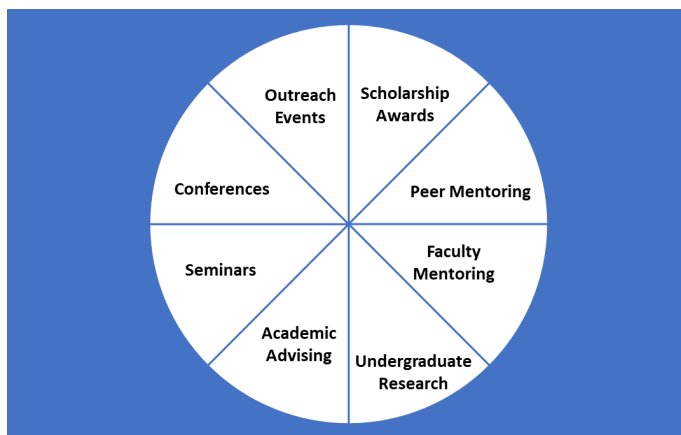
Figure 1. FCC Engineering Scholars program components