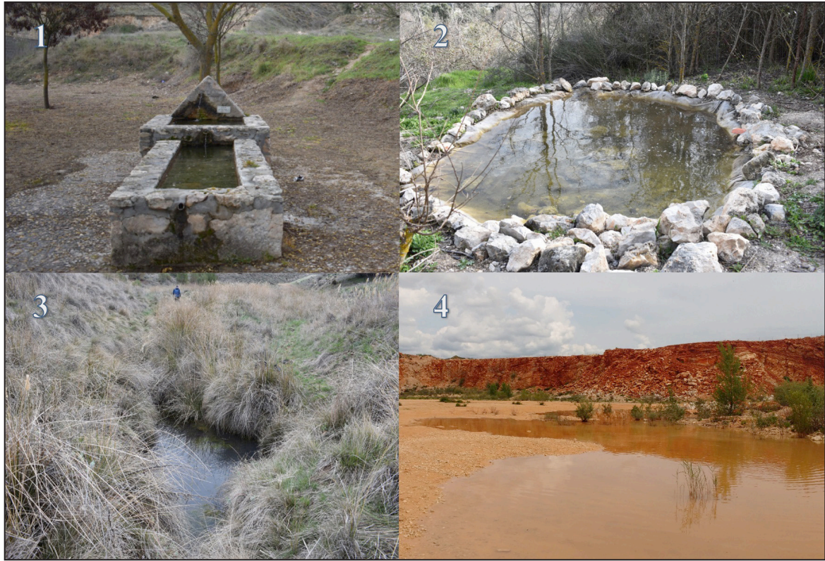
FIGURE 3. Examples of the types of water bodies surveyed in the study area in Comunidad de Madrid, central Spain. (1) Water tanks with vertical walls (troughs, fountains; locality 57), (2) Artificial, semi-naturalized ponds (locality 54), (3) Natural water sites (swamps, puddles, ponds or streams; locality 22), and (4) Artificial ponds in abandoned quarries (locality 74).

report the two estimates from the visit with the highest recorded abundance (Appendix 2).