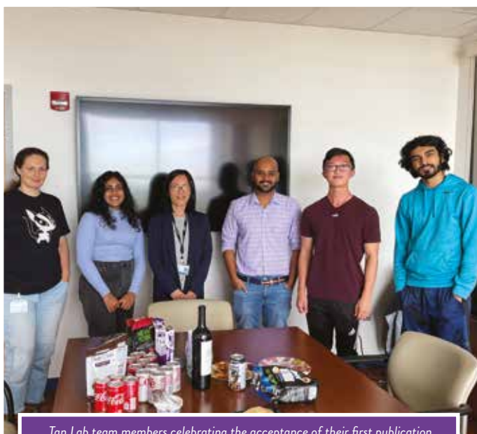
Tan Lab team members celebrating the acceptance of their first publication