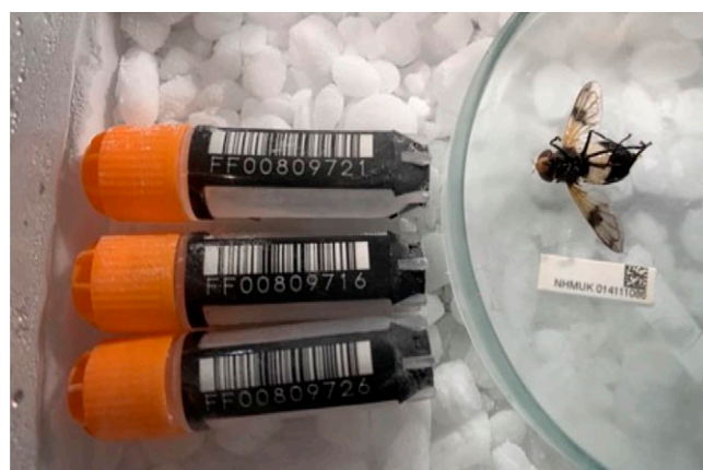
Fig. 1. An example of the documentation that should occur as a sample is being processed. The SPECIMEN_ID (the Natural History Museum, London [NHMUK] barcode under the fly) is photographed alongside the specimen and the barcoded tubes into which different samples of that specimen will be placed. The metadata tracking sheet would have three entries for this fly, where collection-related information would be identical, but tissue type and tissue size would vary (e.g., head, thorax, and abdomen, each in a separate tube).

Quantitative assembly standards. Where sufficient DNA and material is available from a single individual (or clonal colony), currently more than around 100 ng DNA per gigabase genome, we propose a minimum reference standard of 6.C.Q40 (i.e., >1 Mb NG50 contig continuity and chromosomal scale NG50 scaffolding, with less than 1/10,000 nucleotide error rate (see SI Appendix, Table S1 , taken from ref. 10, for notation and further information). When the chromosome NG50 is smaller than a megabase this will be C.C.Q40, with “C” denoting having achieved full chromosome lengths. This standard is now