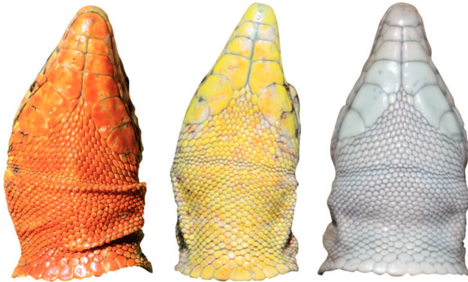
FIGURE 1. Throat color polymorphism in Podarcis erhardii (Brock et al. 2020), a Mediterranean lacertid species. In lacertid lizards, 43 species spanning several genera exhibit a similar color polymorphism. Across all lacertid species in our study, color polymorphism is expressed at adulthood as colorful badges ventrally on the throat or belly region.

Hugall and Stuart-Fox 2012). Given this, on a phylogenetic tree, we would expect ancestral state reconstructions of the evolutionary history of color polymorphism to produce a pattern of ancestral polymorphic lineages diversifying and giving rise to monomorphic lineages.