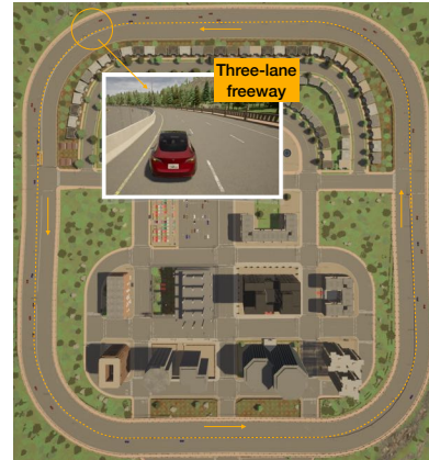
Fig. 1. The example scenario of a 3-lane freeway in CARLA [39]. Vehicles are scattered on the outer-loop of the map “Town 05”. The environment can be mixed traffic with both autonomous and human-driven vehicles.

where w is a trade-off weight. We randomly sample a coalition \mathcal{C} at each timestep. All vehicles in the coalition \mathcal{C} communicate and cooperate with other coalition members. Let R(s, a, \mathcal{C}) = \sum_{i \in \mathcal{C}} R(s, a, \{i\}) to represent the coalition's state-wise reward. While training, we use Shapley value to reallocate the reward to encourage communication-based cooperation and improve the system's total reward in Eq. 3. As analysed in Section V, our reward reallocation method is fair (Proposition 1), efficient (Theorem 1), and stable (Theorem 2).