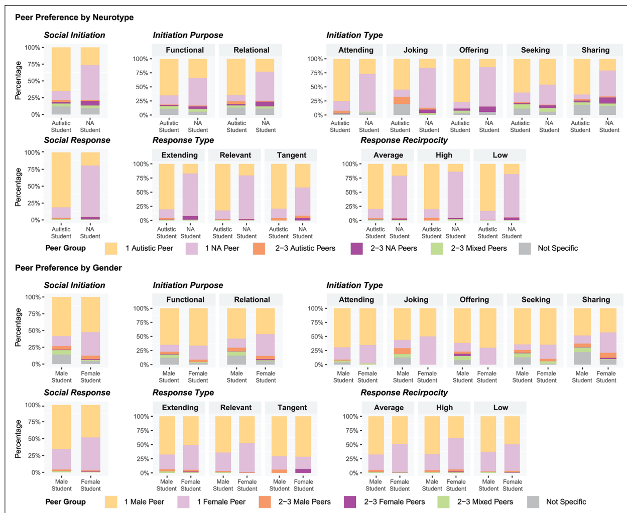
Figure 1. Proportions of social behaviors to peer categories by student groups. NA: non-autistic.

Findings for social initiations toward a single peer found that autistic students showed a significantly higher likelihood to initiate interactions with an autistic peer than a non-autistic peer, while non-autistic students showed lower but not significant likelihoods to initiate with an autistic peer than a non-autistic peer. Over time, non-autistic students were significantly less likely to initiate interactions with autistic peers than non-autistic peers, while autistic students showed a non-significant increase in likelihood to initiate interactions with an autistic peer than a non-autistic peer. Initiations toward multiple peers showed non-significant same-group preferences in both autistic and non-autistic students, which significantly increased over time.