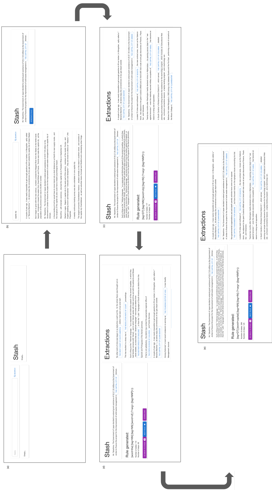
Figure 2: Walkthrough example of the user interface.