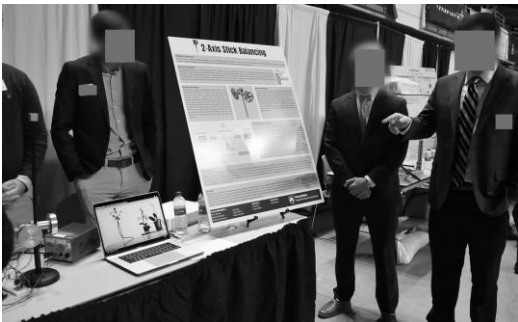
Figure 4. Team 3 presenting their project pitch

it fits all the other specs that are needed, uh, cannot accelerate fast enough to create a larger angle. Then mechanically, uh, the issues that we kind of ran into is, uh, kind of like also time and financial issues. So the flywheels [student gestures towards prototype] should technically be, uh, cut out and kind of made a little more like finely and more even. But we do not really have experience in terms of machining, so we did the best that we could, um, with the budget that we had...”