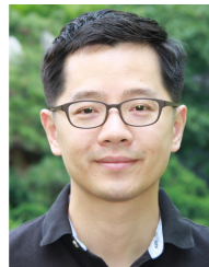
Transacations on Visualization and Computer Graphics.