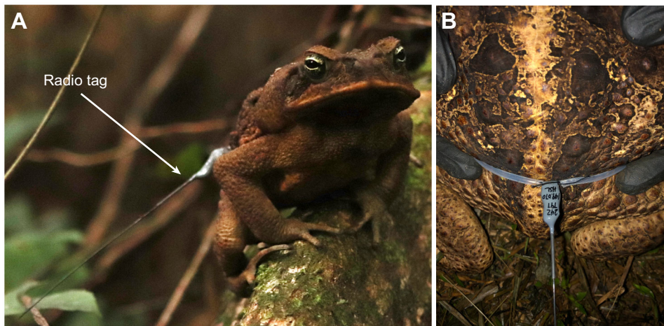
Fig. 1. Rhinella marina toads tagged with radio transmitters. (A) A male toad with an attached radio transmitter. (B) Close up of a radio transmitter attached to a toad's waist with a belt of silicone tubing.

distance between two baseline points) was calculated by visually selecting and exporting outermost baseline points in ArcGIS and calculating distance in R. Total movement (cumulative path observed) was calculated by creating trajectory objects for individuals in adehabitatLT . The package ' adehabitatHR ' ( https://CRAN.R-project.org/package=adehabitatHR ) was used to calculate minimum convex polygons (MCPs) for baseline data. Coordinates of the mean center of baseline activity were calculated in ArcGIS. To account for the variability in baseline tracking duration, we calculated the movement per day of observation as well as the proportion of days with larger (>10 m) movements. For these calculations, any period greater than 48 h in which toad location was not recorded was discarded. Straightness of homing trajectories was calculated by dividing the distance between the translocation release site and the point at which the toad was considered home by the cumulative movement measured. A straightness index of 1 indicates a toad that traveled in a completely straight line, with values approaching 0 indicating less direct routes taken. Normality of data was determined by Shapiro–Wilks test. Comparisons for normal data were performed with a t -test and comparisons of non-parametric data were performed with a Mann–Whitney U -test. All statistical tests of significance were performed in R (version 4.0.2).