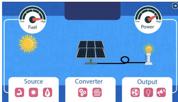
Figure 1 Screenshot from Science Explorer