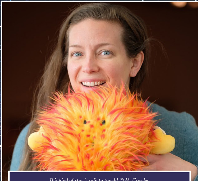
This kind of star is safe to touch!