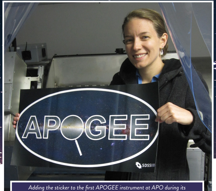
Adding the sticker to the first APOGEE instrument at APO during its commissioning – the most important step!