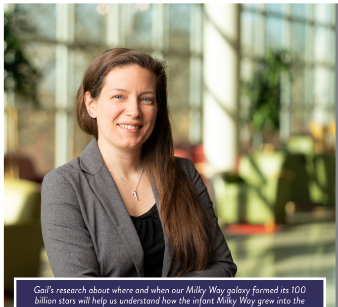
Gail's research about where and when our Milky Way galaxy formed its 100 billion stars will help us understand how the infant Milky Way grew into the current massive spiral galaxy